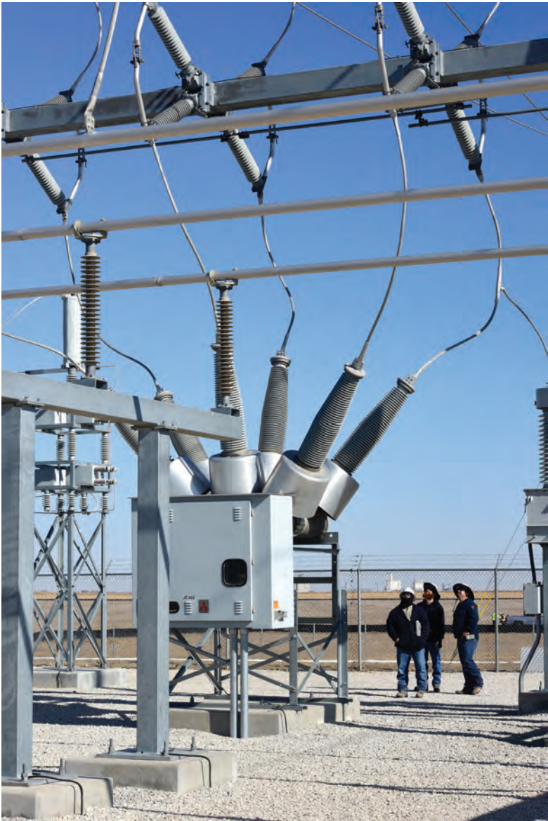
Above: Crews from Sunflower and Pioneer Electric Cooperative work together as they upgrade the line with new insulators south of the Johnson Corner Substation on Nov. 14, 2019, in Stanton County. The line voltage will be upgraded from 69 kV to 115 kV.

Source: 1 https://www.bestplaces.net/climate/city/kansas/johnson-city