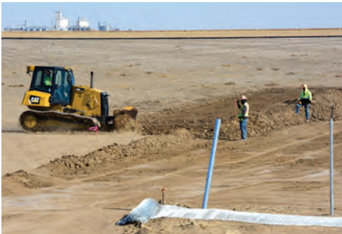
Below: Ground work continues on Nov. 6, 2019, at the site of the future Johnson Corner Solar Project near Johnson City, Kan.

“While there may not be broad agreement on issues like tax rates, there is strong agreement on the value electric cooperatives provide their members and their place in the tax code.”